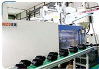
1. Model Casting