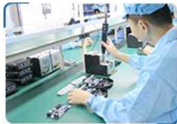
4. Motherboard Assembling