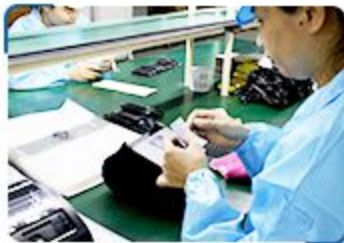
6. Pasting logo label