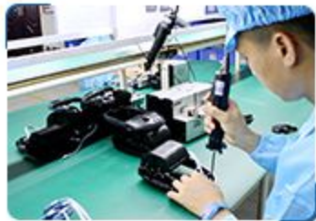
5. Accessories Assembling