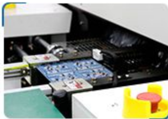
2. Surface Mount Technology