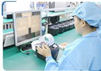
7. Printer Testing