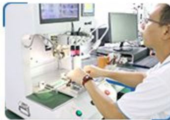
3. Movement Producing