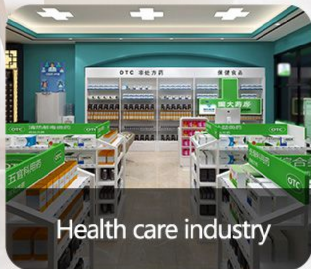
Health care industry